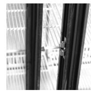
Door holder for loading of the cabinet