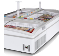
Island installation, shelves as accessory