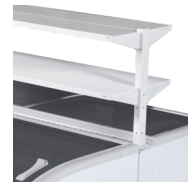
Promotional shelves as assessorry