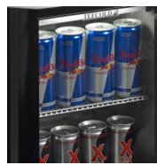
Designed for Energy-cans