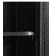
LED light inside door frame