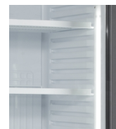
Vertical internal light