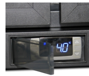
Protective thermostat cover