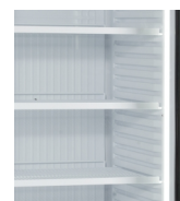
Vertical internal light