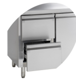
Drawers available as separate kit