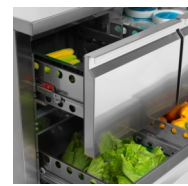
Drawers available as separate kit