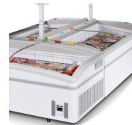
Island installation, shelves as accessory