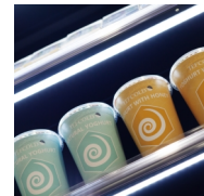
LED light under each shelf