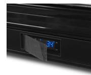
Protective thermostat cover