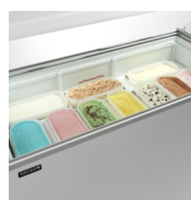
Scooping basket option