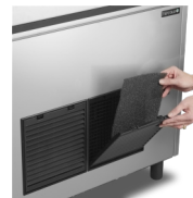
Easy to clean condenser filter