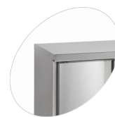
Available without splash back