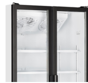
Full height doors