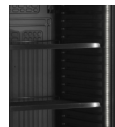
LED light inside door frame