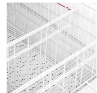
Adjustable false base