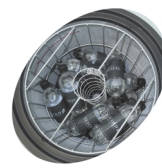
Internal fan and basket