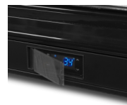
Protective thermostat cover