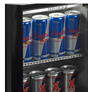
Designed for Energy-cans