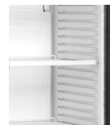
LED light inside door frame