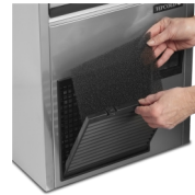
Easy to clean condenser filter