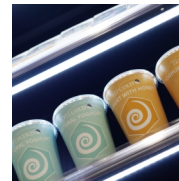
LED light under each shelf