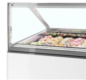
Heated front glass