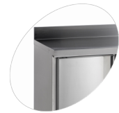
Available with splash back