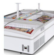
Island installation, shelves as accessory