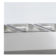
Accepts GN1/3 pan(s) (not supplied)

TOP CHILLING DISPLAY GN1/3 GLASS - 8 X GN1/3 - without trays