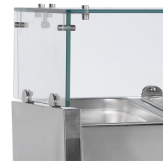
Glass structure for protection of food