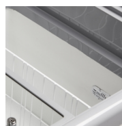
White coated steel inner liner