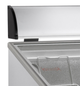
Illuminated display board as option (accessory)