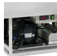
Automatic evaporation of defrost water