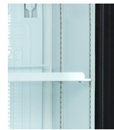
LED light inside door frame