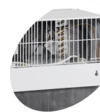
Wall hanging bracket