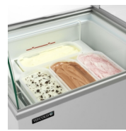
Scooping basket option