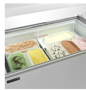
Scooping basket option