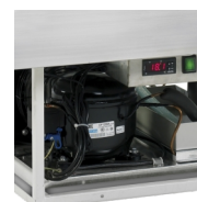
Automatic evaporation of defrost water