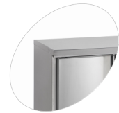
Available without splash back