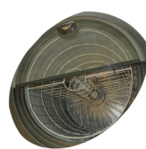
Internal fan and basket