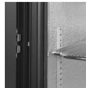
Door holder for loading of the cabinet