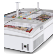
Island installation, shelves as accessory