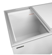
Flat sliding solid lids