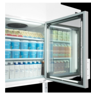
LED light inside door frame