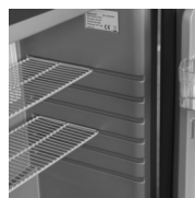
Adjustable shelves, also in door