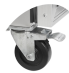
Strong castors as option